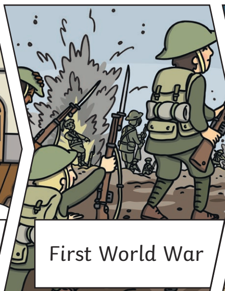
First World War